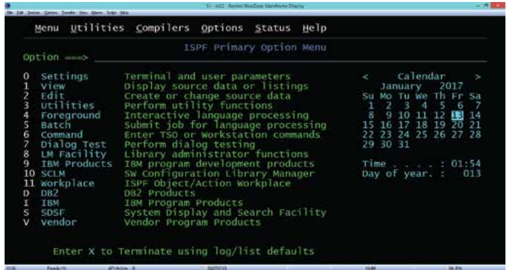
Figure 1: Rocket BlueZone Terminal Emulation Desktop-Based Session

Rocket BlueZone Web empowers your employees to be more productive and offer better customer support by immediately accessing inventory anywhere, on any device. Rocket BlueZone Web is a zero-footprint terminal emulator that delivers real-time access to enterprise applications via HTML5 in a browser.