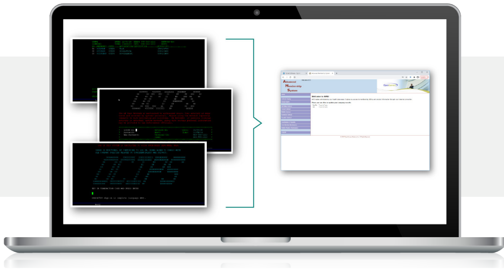
Figure 3: Combine multiple screens into a single page