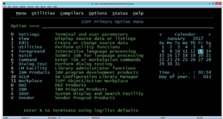
Figure 1: Rocket BlueZone terminal emulation desktop-based session

Rocket BlueZone is a secure terminal emulation solution that can protect your critical business systems and lower your total cost of ownership.