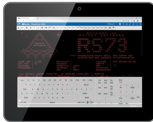
Figure 2: Rocket BlueZone Web terminal emulator shown with customizable keyboard on a tablet