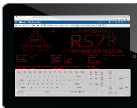
Figure 2: Rocket BlueZone Web terminal emulator shown with customizable keyboard on a tablet

Rocket BlueZone Web is a zero-footprint terminal emulator that delivers all of its functionality via HTML5 through a browser, without the need for locally-installed apps or plug-ins.