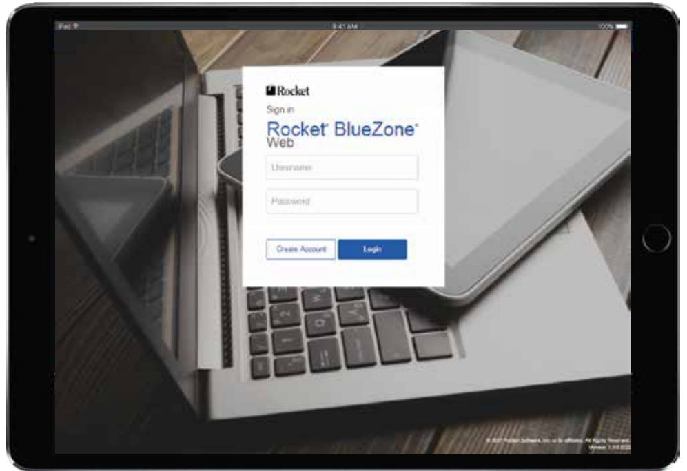
Figure 1: Secure terminal emulation on a tablet device with Rocket BlueZone Web

Rocket BlueZone Web offers secure access to host based applications anywhere, from any device, including PCs, Chromebooks, tablets, and even smartphones.