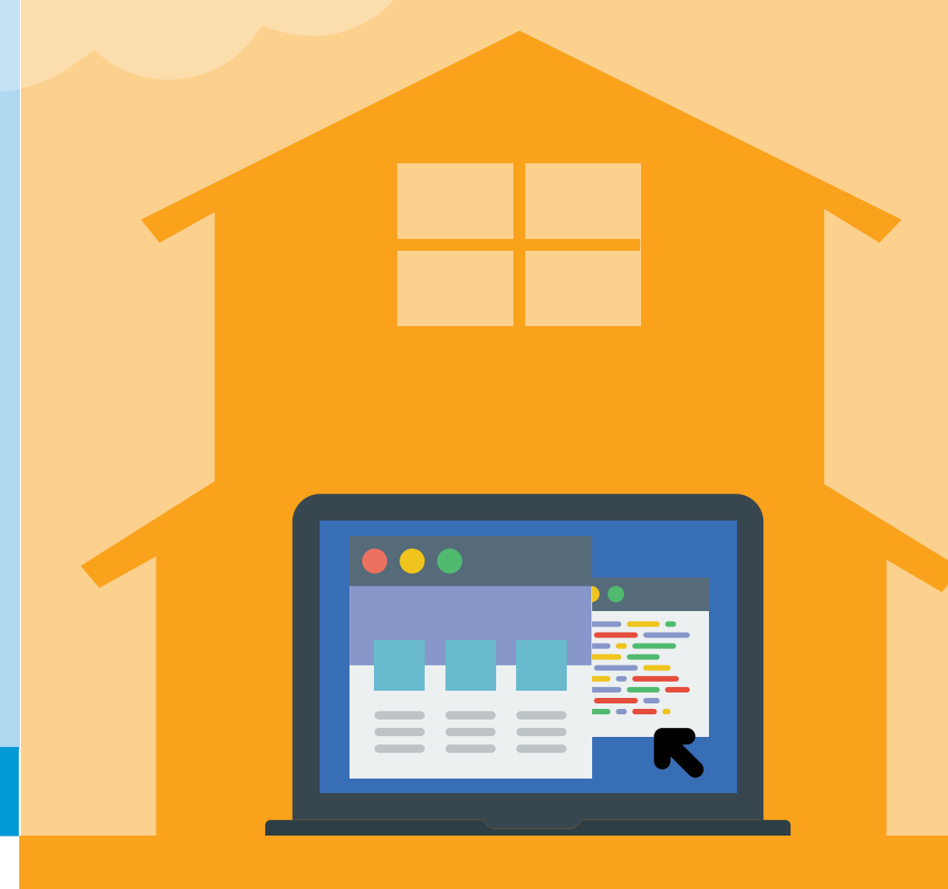
Application Rewrite / Restructuring