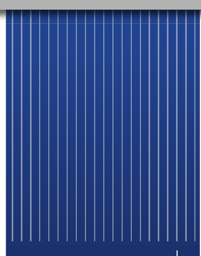
Alaska State Legislature Juneau, Alaska

Folio is the only product that lends itself to working with parts of documents rather than the entire file as a monolithic block. Wilson notes that, "A lot of products handle minutes very well, but statutes are another matter entirely because they include long documents with segments that are related to other segments. Context is extremely important, and I have found very few products that handle those sorts of things well. For large documents with discrete segments, it's really nice. I can get right to the information I need and have the ability to scroll to the adjacent sections—most search tools don't allow that kind of flexibility. That's what I like."