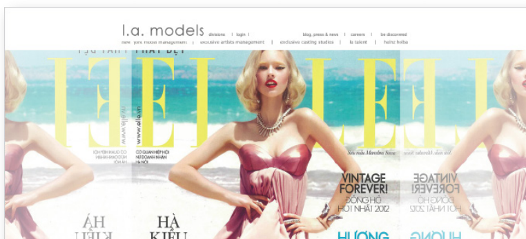
The solution had to handle photographs of model resources